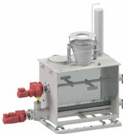
Type SD 160-Industry