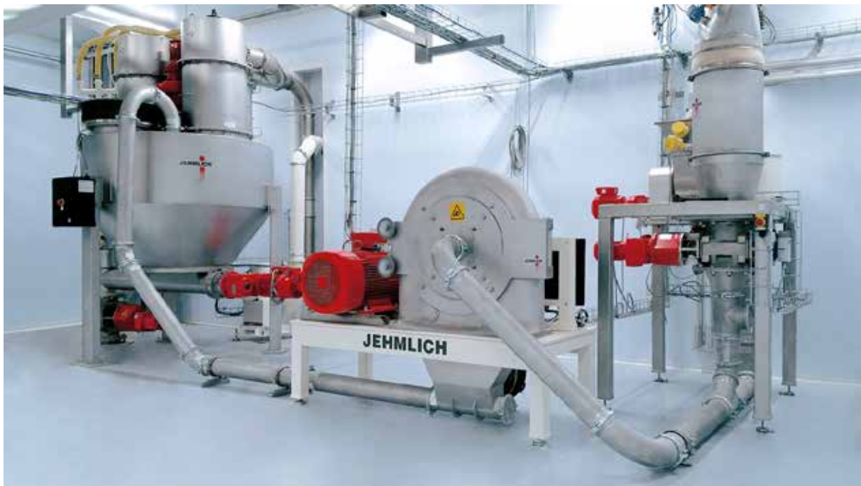
Example: REKORD Sugar Grinding system with stirred icing sugar buffer container, net volume 1.500 liters