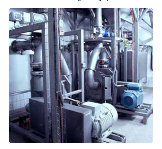
REKORD 630 GMP fine grinding system for lactose