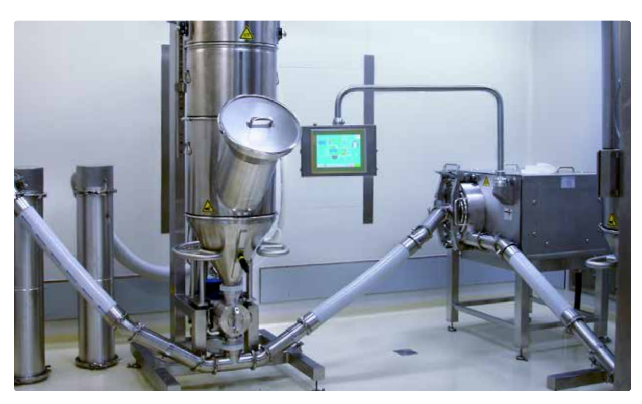
REKORD 315 GMP fine grinding system for cell culture feed